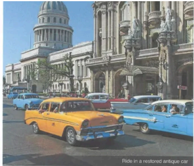
Ride in a restored antique car

DAY 2 Old Havana: The day is spent getting a taste of local life in Havana. During a walking tour, discover the four main squares of the city: San Francisco, Plaza de Armas, Plaza Vieja, and Cathedral Square, each well-known for historic importance, architectural beauty and / or social atmospheres. Your local guide will provide details of their significance to the city, and you'll have the chance to meet the local people when stopping at the various sites. While visiting the San José Craft Market, mix and mingle with the artisans and vendors, learn about their art and shop for indigenous handicrafts. A truly local experience awaits as you witness the process of making an authentic cigar with local entrepreneurs. Visit a private cigar shop to see how this ancient art is kept alive and is a major contributor to the local economy. Lunch is included at a paladar during today's excursion. This evening, you're in for a special treat as vintage American cars meet you at the hotel. Travel in style in these restored antique cars while enjoying a panoramic drive along