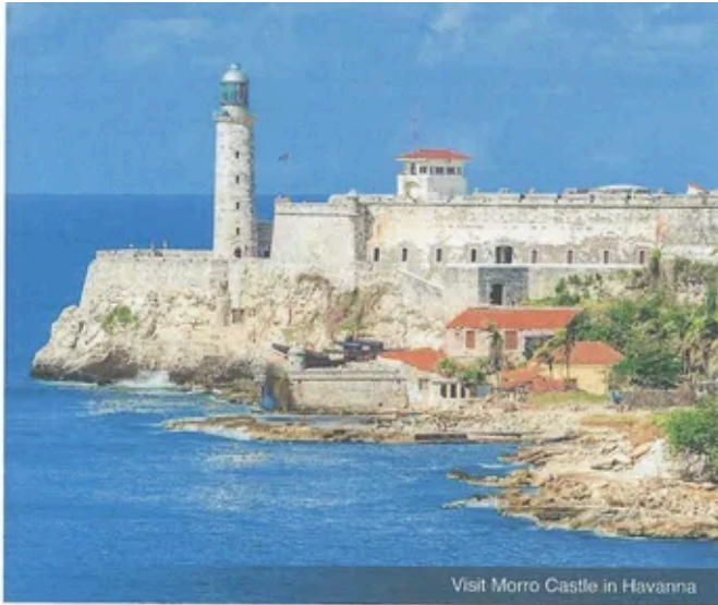
Visit Morro Castle in Havana

such an important role in changing the lives of the children. After lunch at a paladar, attend an interactive and cultural exchange with dancers when visiting a dance studio. Talk with the teacher and students, see how the Cuban Salsa is done, and learn how to do this dance yourself! This evening, dinner is held at a local paladar for your immersion into local culture, dining on local cuisine and mingling with the staff. Meals: B, L, D